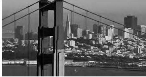
Port of San Francisco September 9, 2010

California Environmental Protection Agency